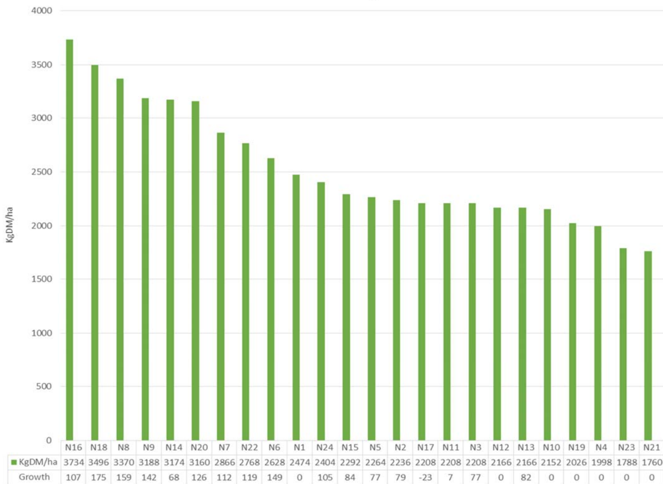
Waiora Feed Wedge